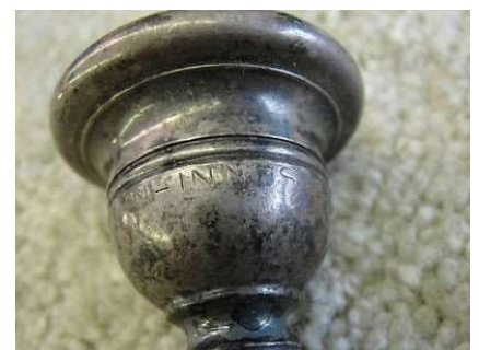
Conn Innes mouthpiece